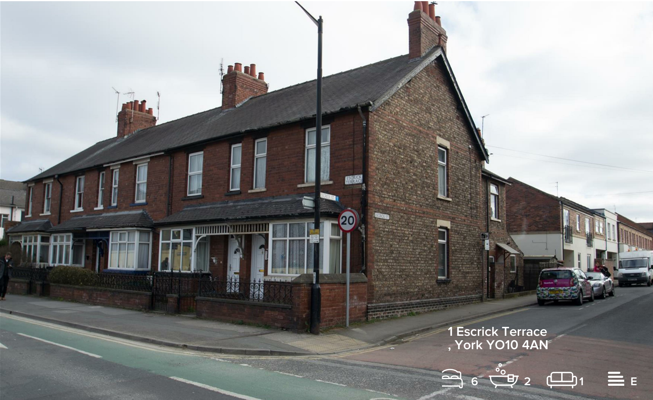
1 Escrick Terrace , York YO10 4AN